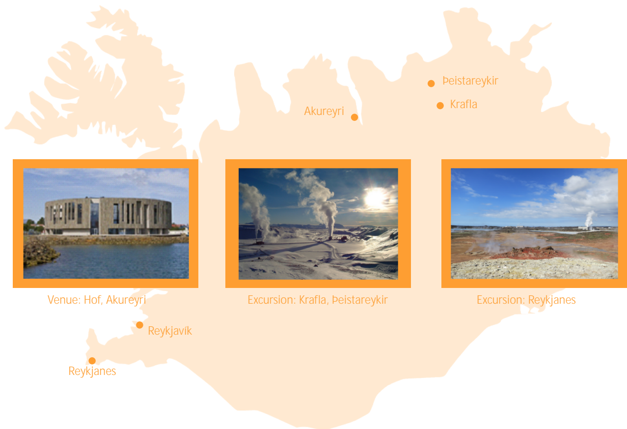
IMAGE final conference, Novel approaches for Geothermal Exploration marks the end of a four years long project on exploration and assessment of geothermal reservoirs. Presentations from related topics and projects are invited. A total of six sessions will be held and one poster session.